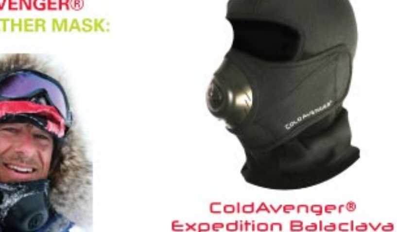
Stay comfortable all season long with the ColdAvenger®